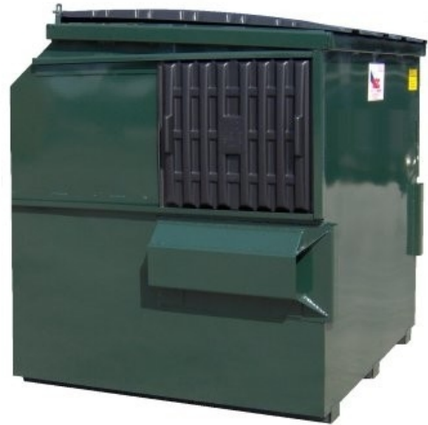
Six, eight, and ten cubic yard Hi-Side