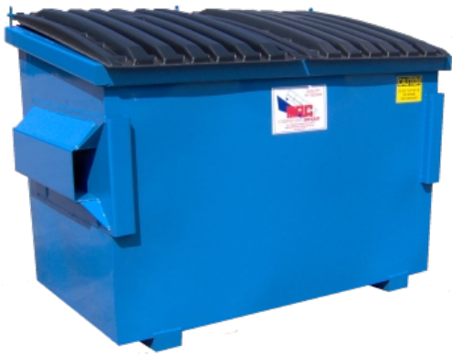
Two, three, and four cubic yard style

Available in two through ten cubic yard capacities, MAC front load containers are constructed of quality AISI grade steel and designed for years of rugged dependable service. Each container meets or exceeds all industry standards and carries a full one year warranty.